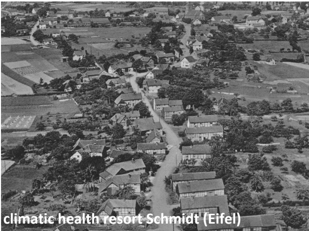
climatic health resort Schmidt (Eifel)