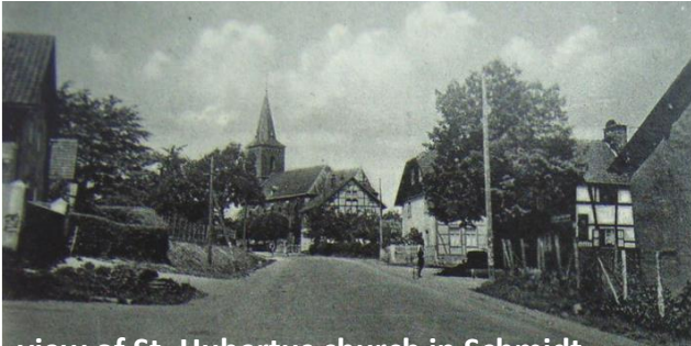
view of St. Hubertus church in Schmidt