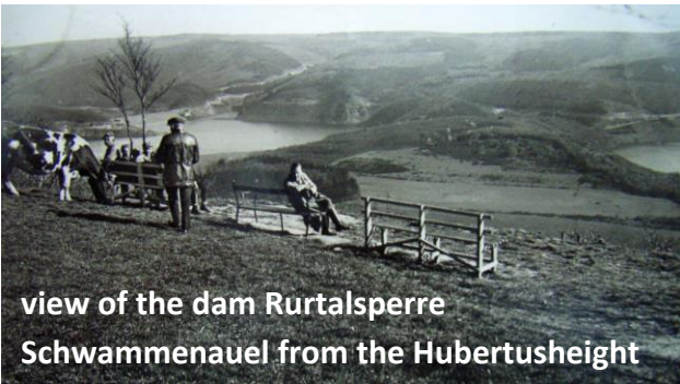
view of the dam Rurtalsperre Schwammenauel from the Hubertusheight