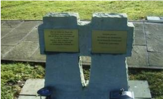
picture: war cemetery in the Huertgen forest (former battlefield height 470)

The memoration of the victims, the international relationships or the admonition for peace can be remembered by the walks on historical tracks more than 77 years after the end of the horrible conflict.